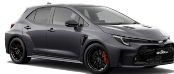
● Matte Steel 13 1M1