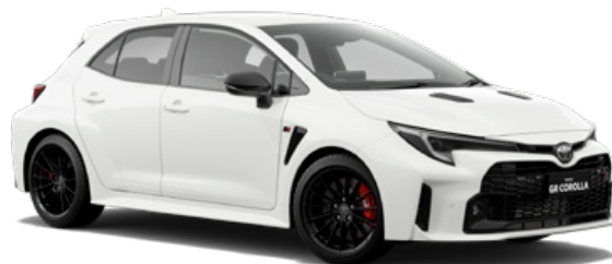
○ Glacier White 040

Choose your colour for GR Corolla and make your mark on the road. From simple white to bold statements in style, you're sure to find one to match your desire for thrilling performance on any road, every day.