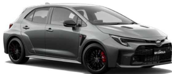
● Liquid Mercury 13 1L5