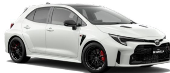
○ Frosted White 13 089