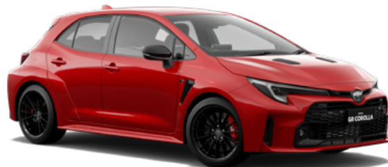
● Feverish Red 13 3U5