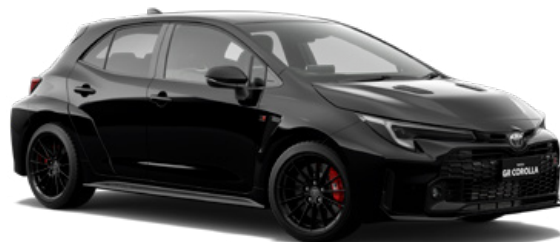
● Ebony 13 202