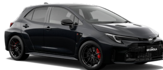
● Tarmac Black 13 219