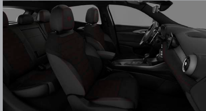
783 - Perforated Black Alcantara and Leatherette Seats with Embroidered Alfa Romeo Logo and Red Stitching (Standard on Veloce Hybrid)