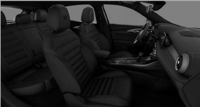
428 - Perforated Black Leather-Accented Seats with Embroidered Alfa Romeo Logo and Dark Grey Double Stitching (Option on Ti Hybrid)