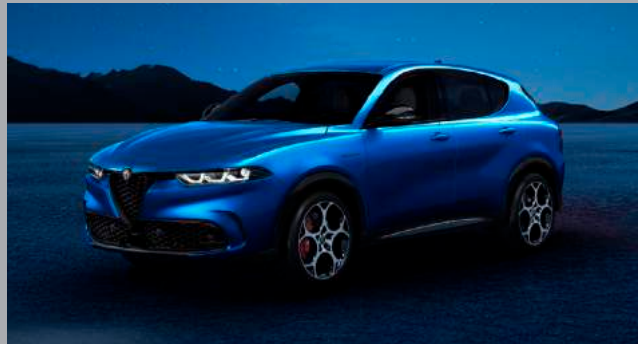
Misano Blue Metallic (3YS)