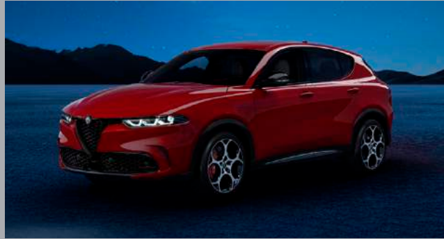
Alfa Red (1WY)