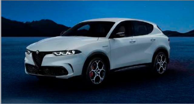
Alfa White (1WX)