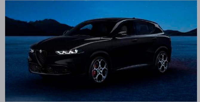
Alfa Black (6FX)