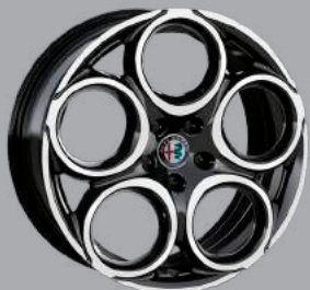
WBR – Ti (Standard)