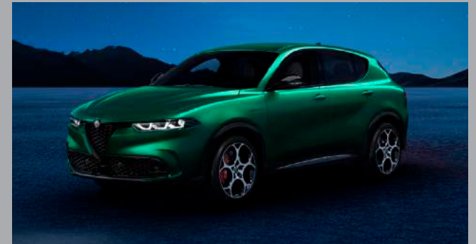
Montreal Green (6FW)