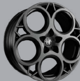
1M4 – Veloce (Option)