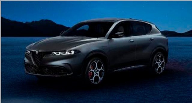
Vesuvio Grey Metallic (3XV)