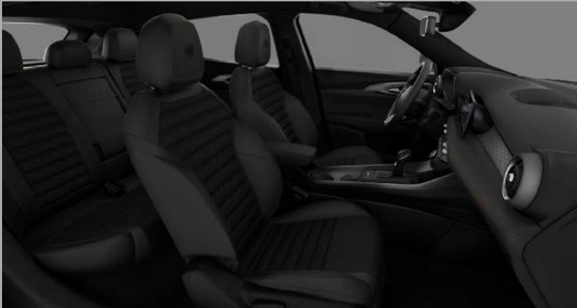
047 - Carbon Cloth and Leatherette Seats with Electro-welded Alfa Romeo Logo and Biscotto Stitching (Standard on Ti Hybrid)