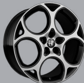
1MM – Veloce (Standard)