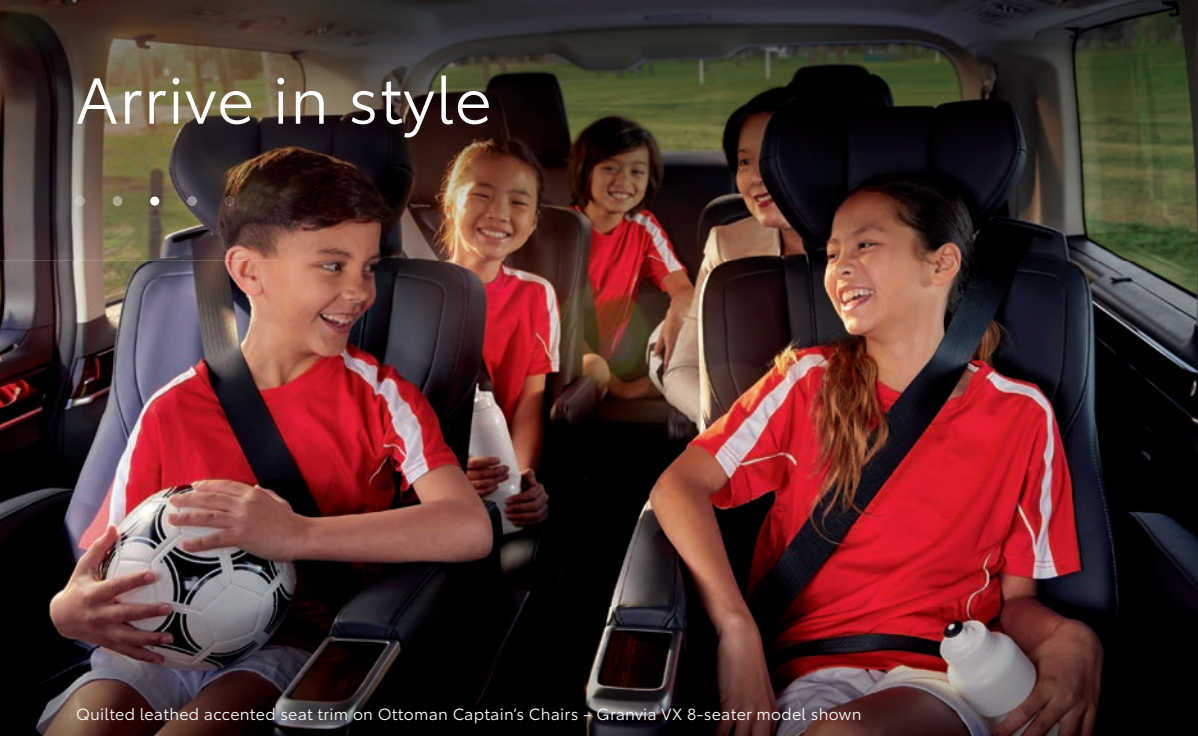
Quilted leathed accented seat trim on Ottoman Captain's Chairs - Granvia VX 8-seater model shown