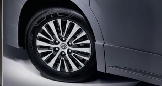
17" alloy wheels