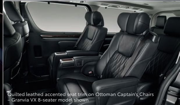
Quilted leathed accented seat trim on Ottoman Captain's Chairs - Granvia VX 8-seater model shown