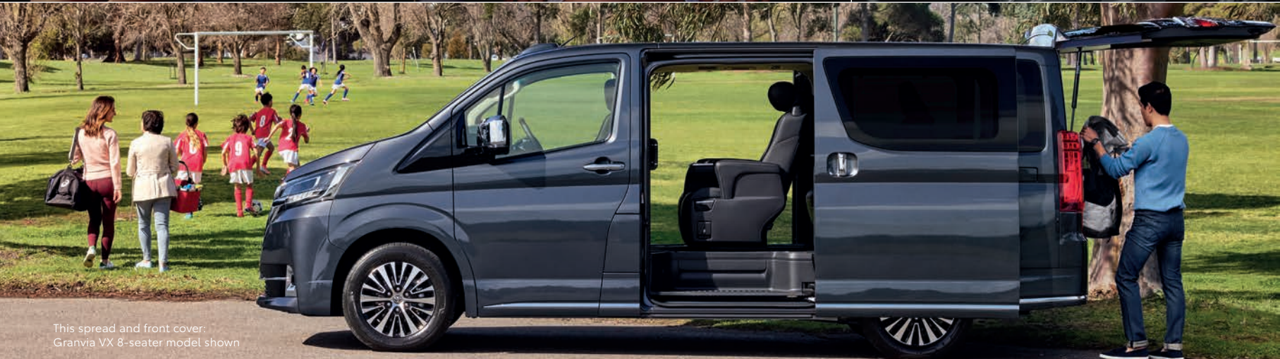
This spread and front cover: Granvia VX 8-seater model shown