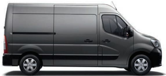
front-wheel drive panel van

You have a wide range of different needs, which can be met by the wide range of interior fittings and length x height combinations of Renault Master, with a load volume of from 8 m 3 to 17 m 3 .