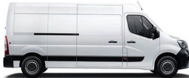
rear-wheel drive panel van