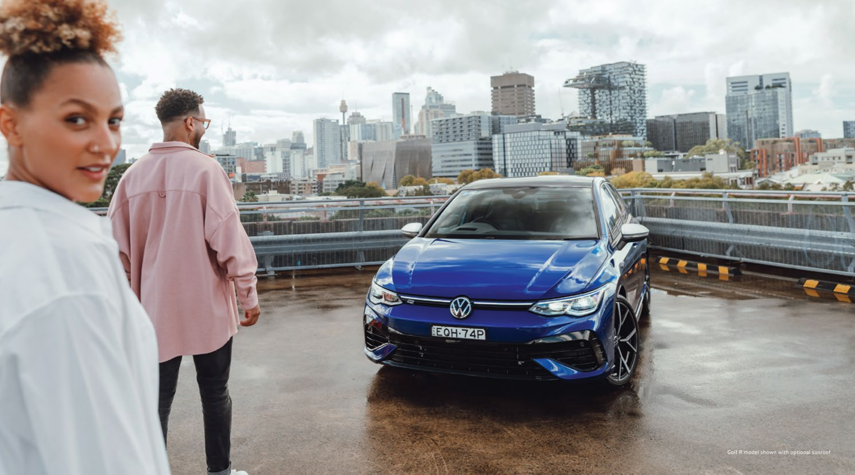
Golf R model shown with optional sunroof