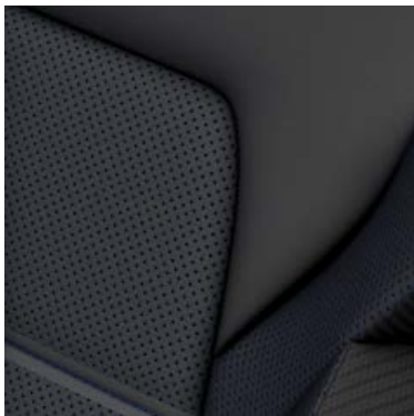
Black Nappa Leather appointed seat upholstery#