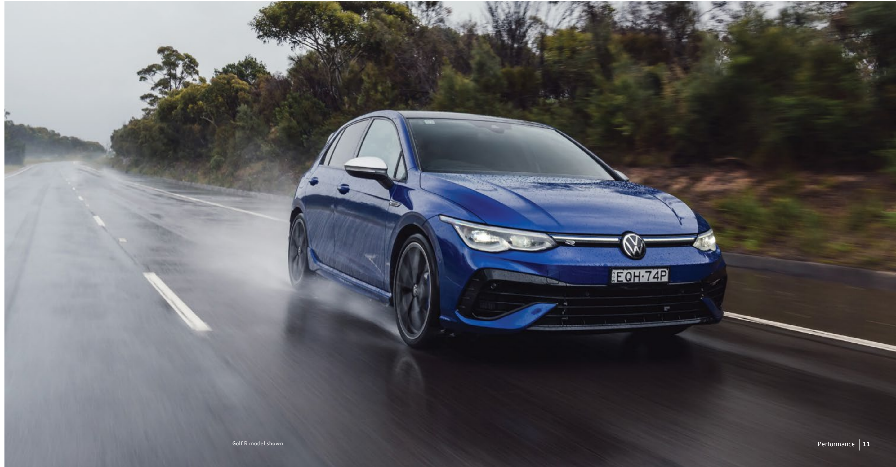
Golf R model shown