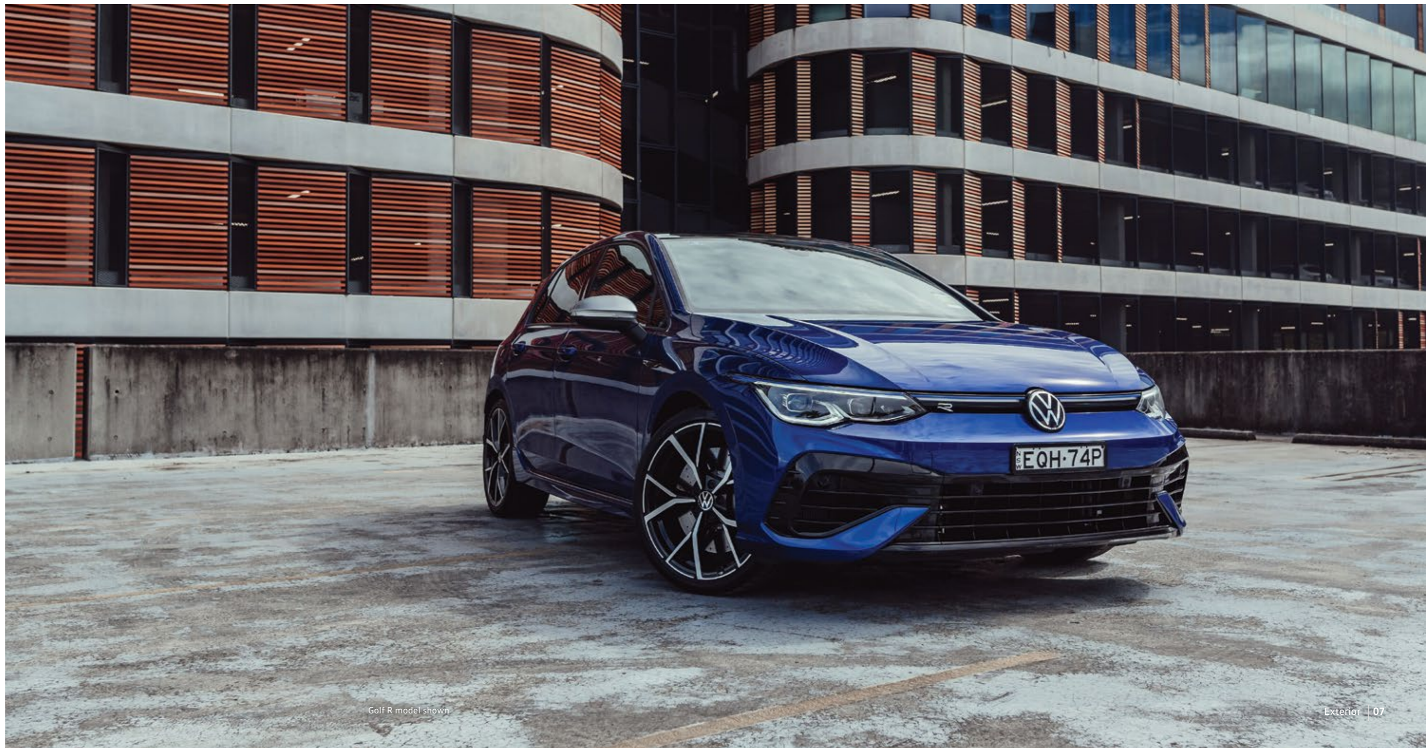
Golf R model shown