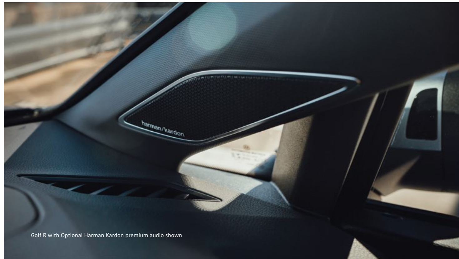
Golf R with Optional Harman Kardon premium audio shown

The Golf R's other optional inclusion, a panoramic electric glass sunroof, is the perfect addition to a car already brimming with great features. Let glorious light stream into the cabin when you retract the sunroof shade – and open up the sunroof for the liberating feeling of the wind in your hair.