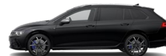
Deep Black PE