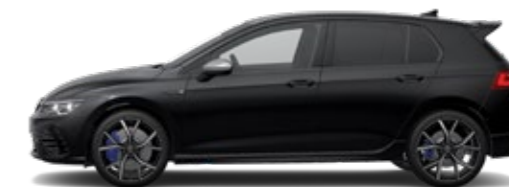
Deep Black PE