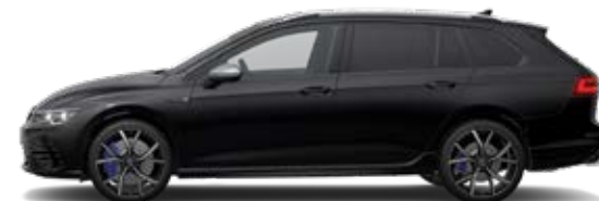
Deep Black PE