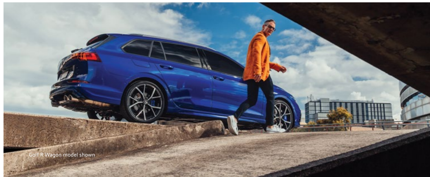
Golf R Wagon model shown

For further proof of the vehicle's uniquely potent styling, you need only look at the Golf R's imposing blue brake calipers. As well as providing outstanding on-road performance and ruthless stopping power, they are quintessentially a Golf R hallmark.