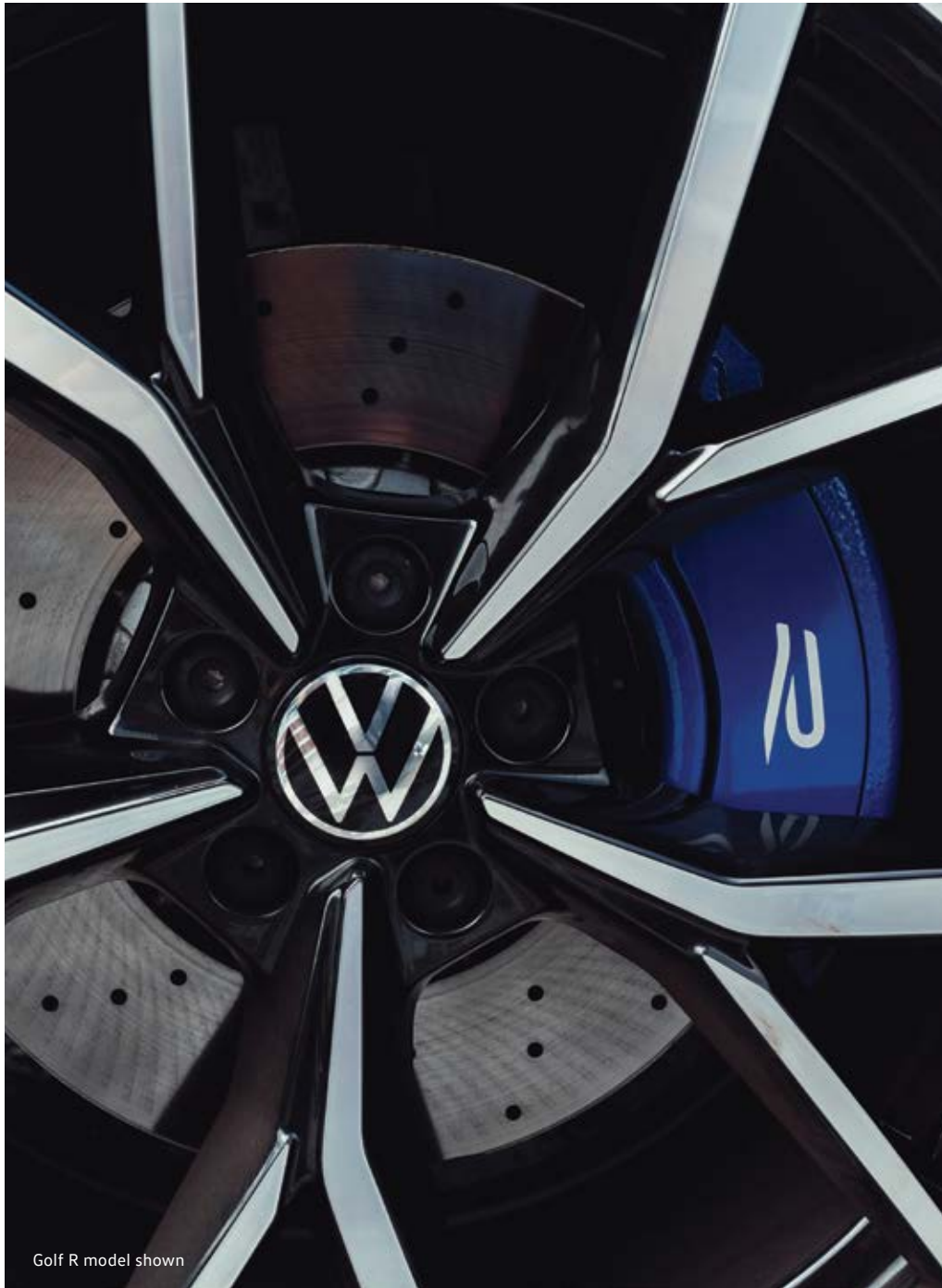
Golf R model shown