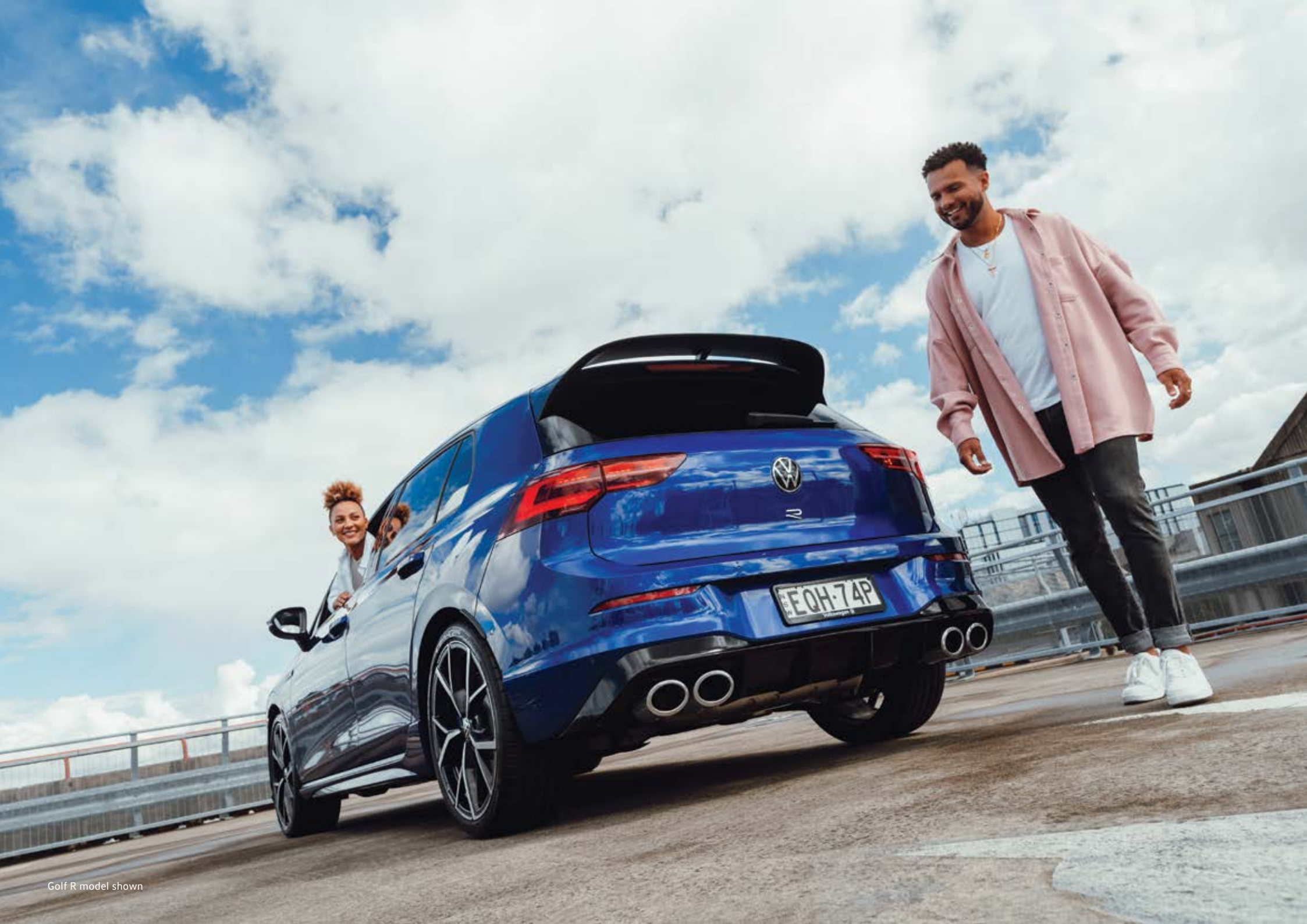
Golf R model shown