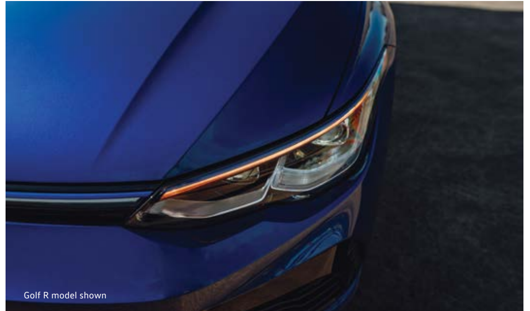
Golf R model shown