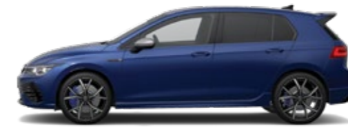
Lapiz Blue PM