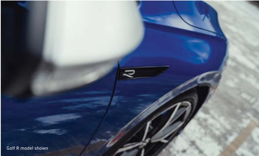
Golf R model shown