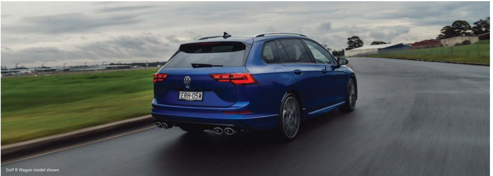
Golf R Wagon model shown