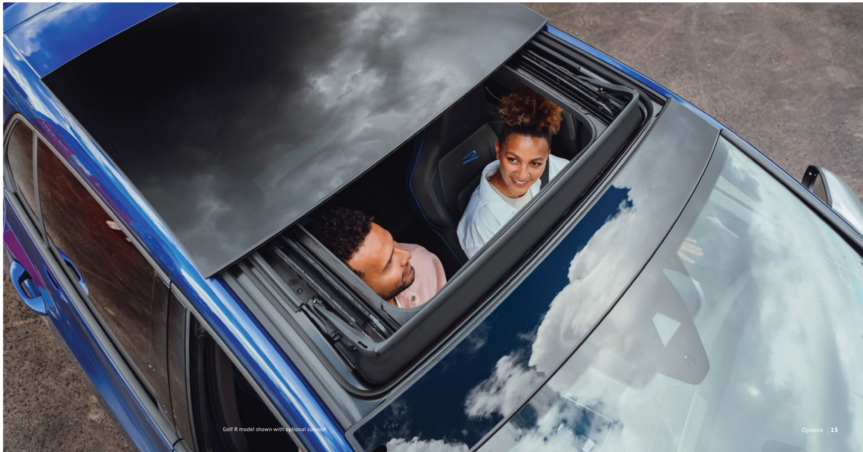
Golf R model shown with optional sunroof