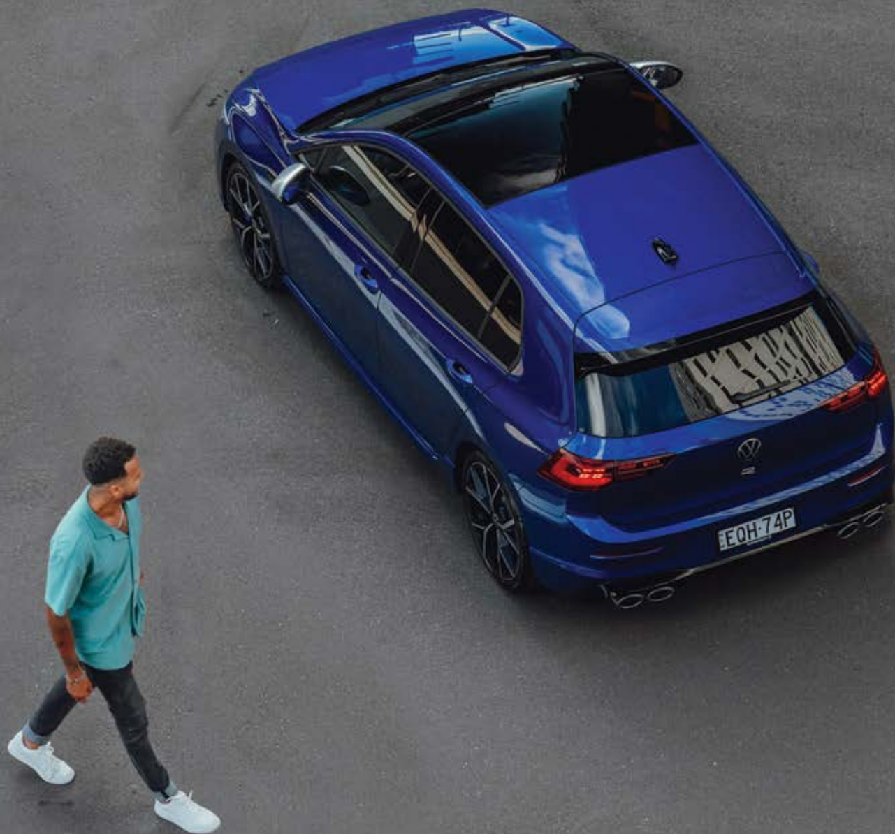
Golf R model shown with optional sunroof