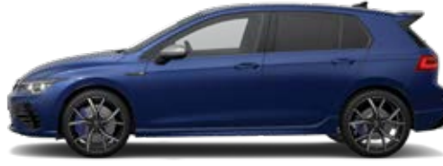
Lapiz Blue PM