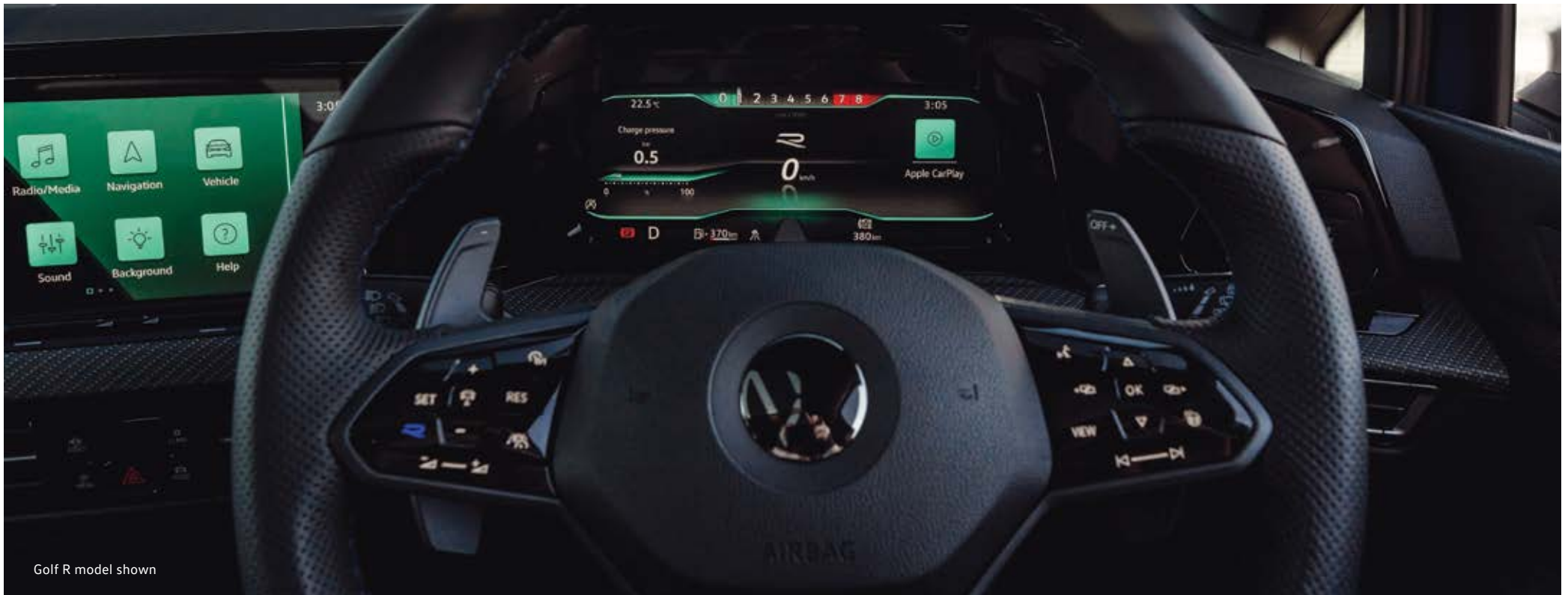
Golf R model shown