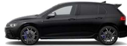
Deep Black PE