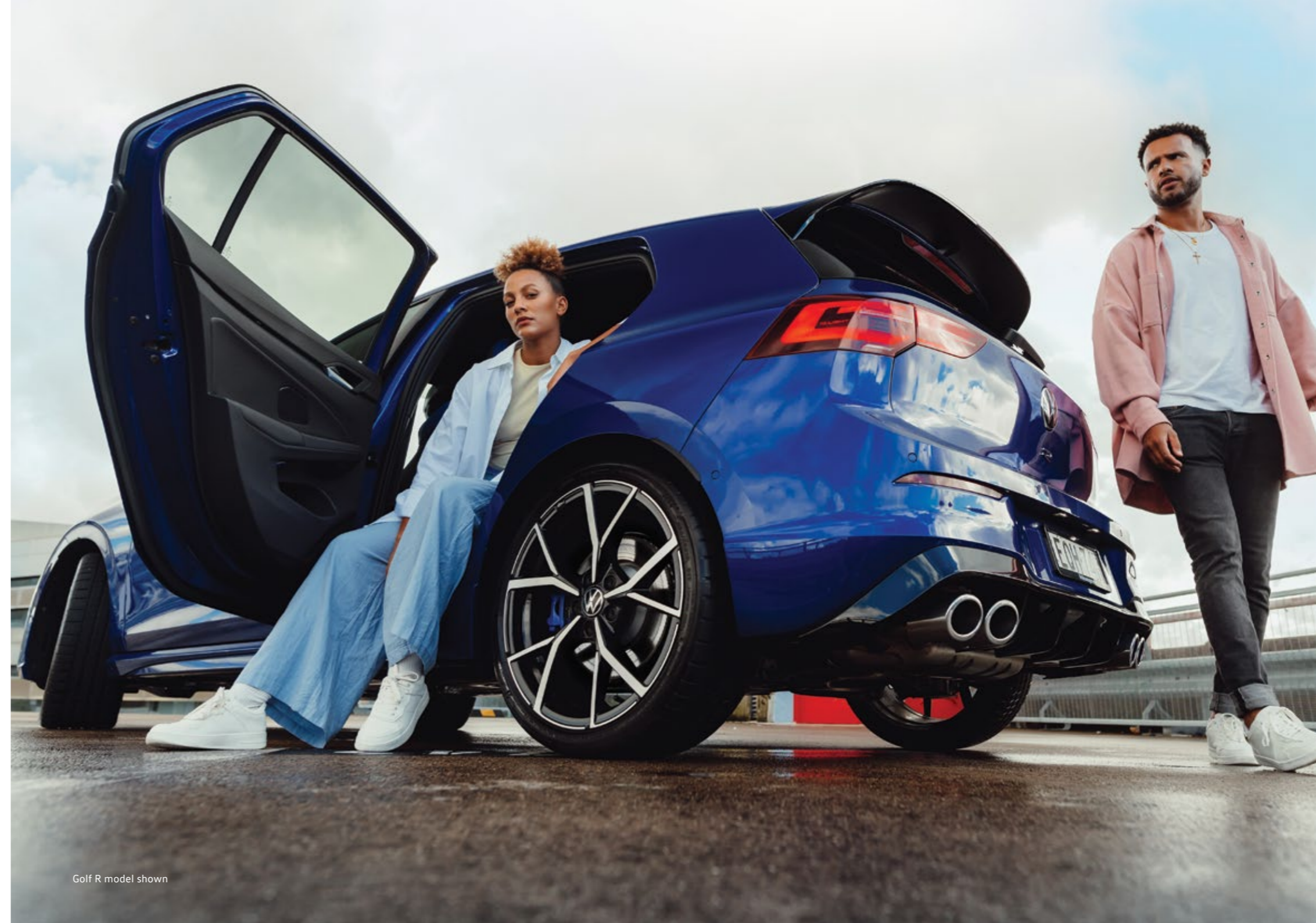
Golf R model shown