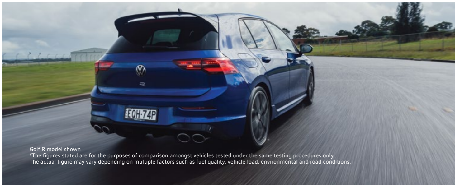
Golf R model shown #The figures stated are for the purposes of comparison amongst vehicles tested under the same testing procedures only. The actual figure may vary depending on multiple factors such as fuel quality, vehicle load, environmental and road conditions.

Of course, the Golf R has the looks to match its blistering on-road performance. With its lowered stance, large front air intake, body-coloured extended side sills and gloss black rear diffuser with four chrome exhaust pipes, the Golf R looks every inch a performance supercar.