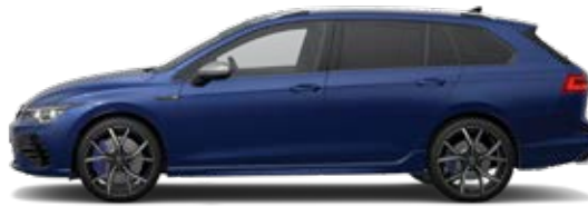
Lapiz Blue PM