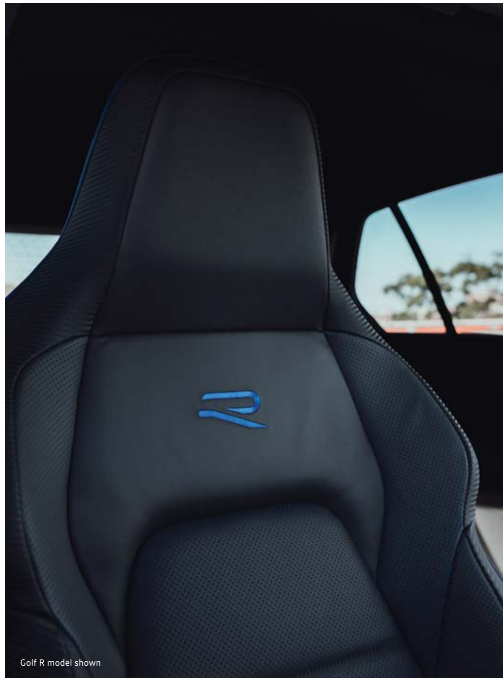
Golf R model shown

S Standard O Optional Extra P Available as part of an optional package — Not available