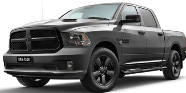
Granite Crystal (M)