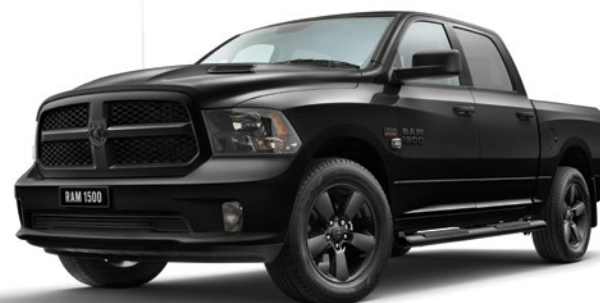
Diamond Black (P)

M = Metallic, P = Pearlescent. Colours have been reproduced as faithfully as possible, however actual colours may vary due to screen settings.