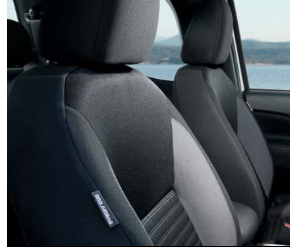
CLOTH SEAT TRIM - SL & ST GRADES

**Premium paint available at extra cost. *Only available on PRO-4X. **Not available on PRO-4X. †Pickup models only.