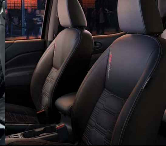
LEATHER-ACCENTED PRO-4X SEATS ‡

A complete ownership experience to help you get the most out of your Nissan. It includes the following: