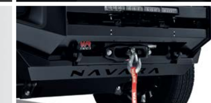
Winch & Winch Fitting Kit