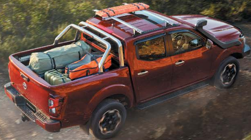
Navara Dual Cab

NISSAN GENUINE ACCESSORIES Complete Confidence