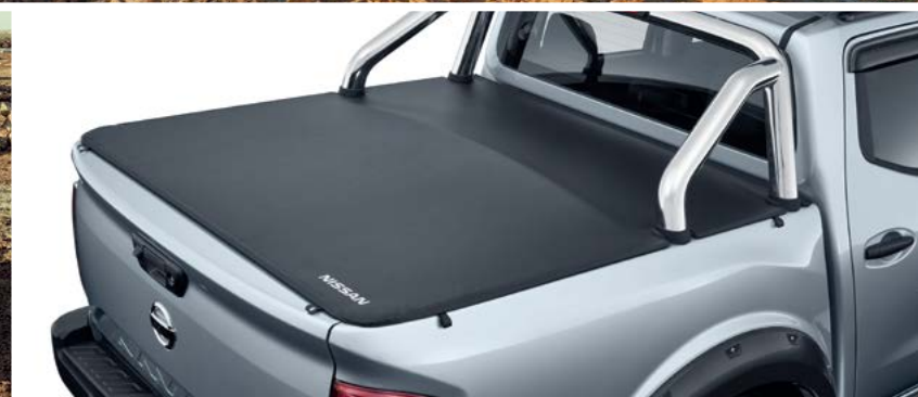
Soft Tonneau Cover