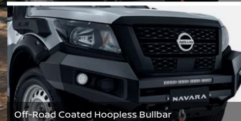
Off-Road Coated Hoopless Bullbar