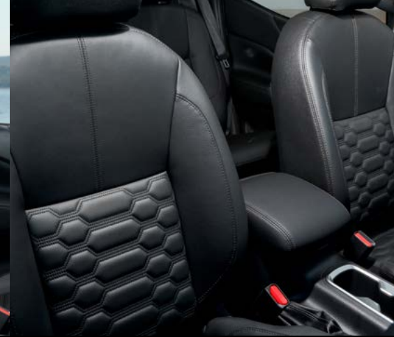
OPTIONAL LEATHER-ACCENTED SEAT TRIM - ST-X GRADES †