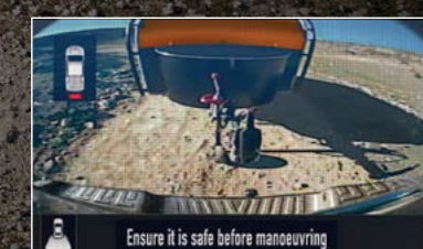
Display screens from overseas model shown.