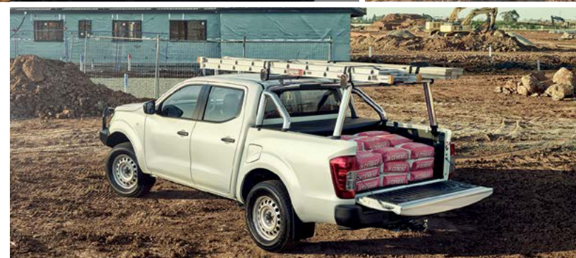
Ladder Racks (Front & Rear)

Nissan Genuine Accessories keep your vehicle complete and help maintain its resale value.