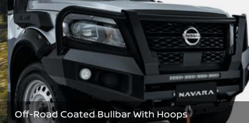
Off-Road Coated Bullbar With Hoops

NISSAN GENUINE ACCESSORIES Complete Confidence