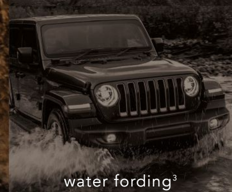
water fording 3