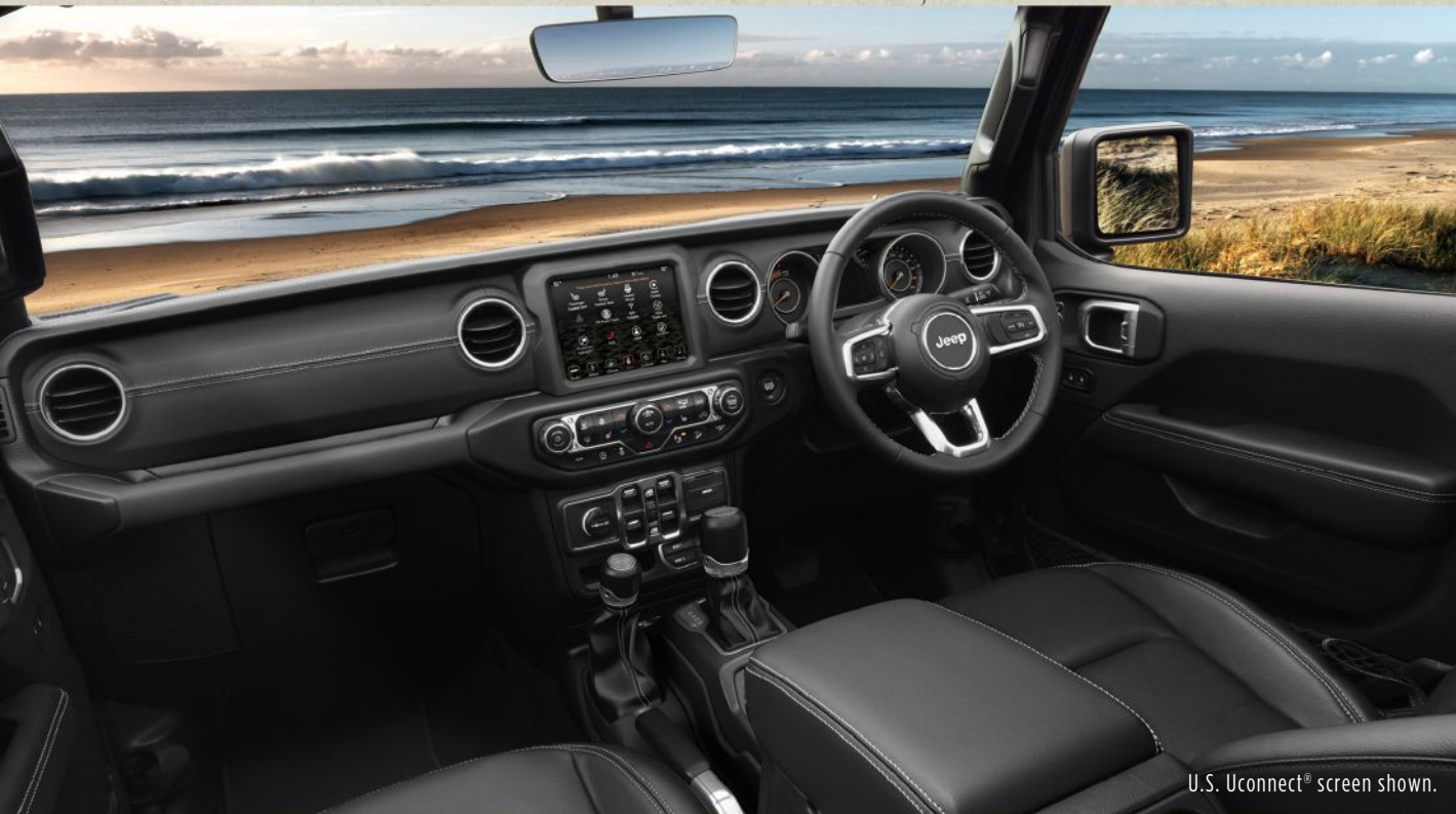
U.S. Uconnect® screen shown.