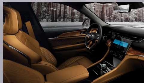
ECT7 - Tupelo Palermo Leather-trim (Option - Summit Reserve)