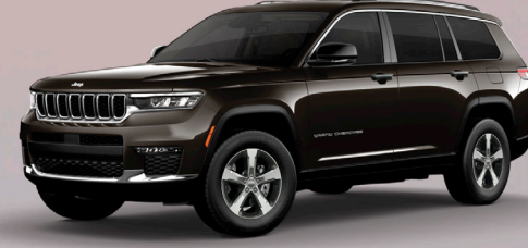
PFJ - Rocky Mountain (Option)