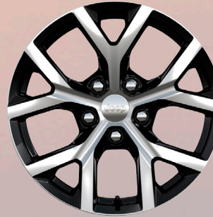
WLH - 18-inch Full Polished / Painted Alloy Wheels (Optional on Overland)