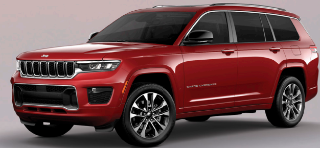
7 seat Overland