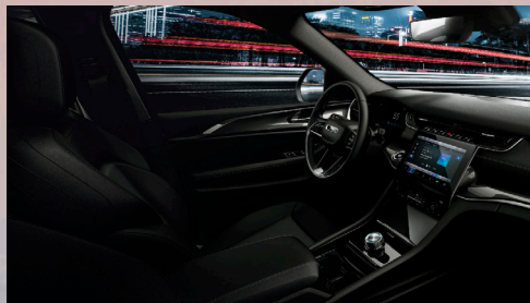
DZX7 - Black Suede & TechnoLeather - accented trim (Standard - Night Eagle)