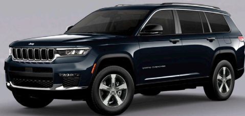
PCQ - Midnight Sky (Option)