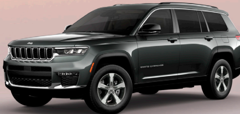
PAS - Baltic Grey (Option)