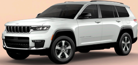
PW7 - Bright White (Standard)