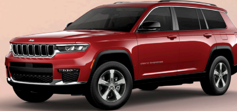
PRV - Velvet Red (Option)