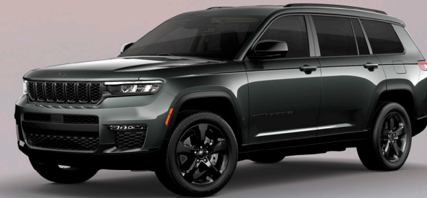
7 seat Night Eagle