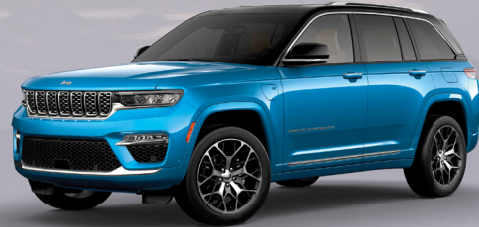
PBJ - Hydro Blue (Option - 5 seat only)