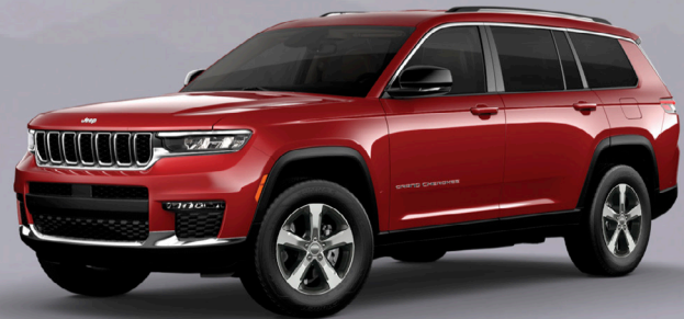
7 seat Limited