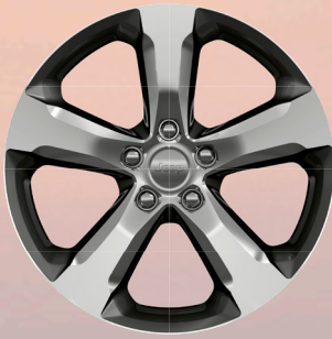
WHG - 20-inch Machined / Painted Alloy Wheels (Standard on Limited)