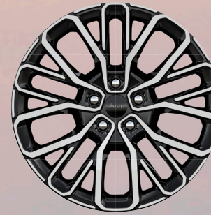
WJE - 21-inch Polished / Painted Alloy Wheels (Standard on Summit Reserve)