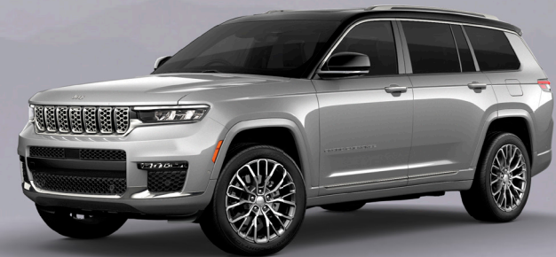
7 seat Summit Reserve