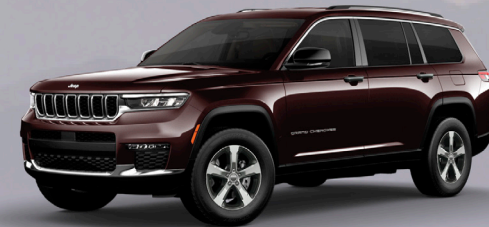
PHC - Ember (Option - 7 seat only)