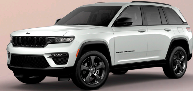
5 seat Night Eagle