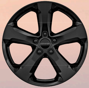
WHF - 20-inch Gloss Black Painted Alloy Wheels (Standard on Night Eagle)