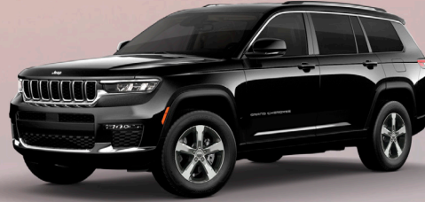
PXJ - Diamond Black (Option)