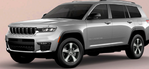
PSE - Silver Zynith (Option)