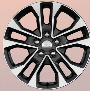
WLJ - 20-inch Full Polished Alloy Wheels (Standard on Overland)