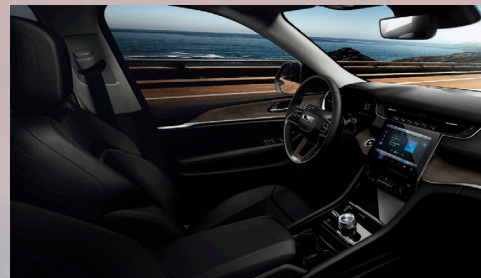
D6X7 - TechnoLeather trim (Standard - Limited)