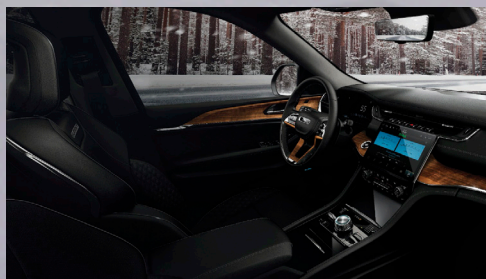
ECX7 - Black Palermo Leather-trim (Standard - Summit Reserve)