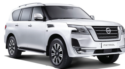
Moonstone White (QAC)*

In some cases, the printed colours may vary from the actual paint colours.