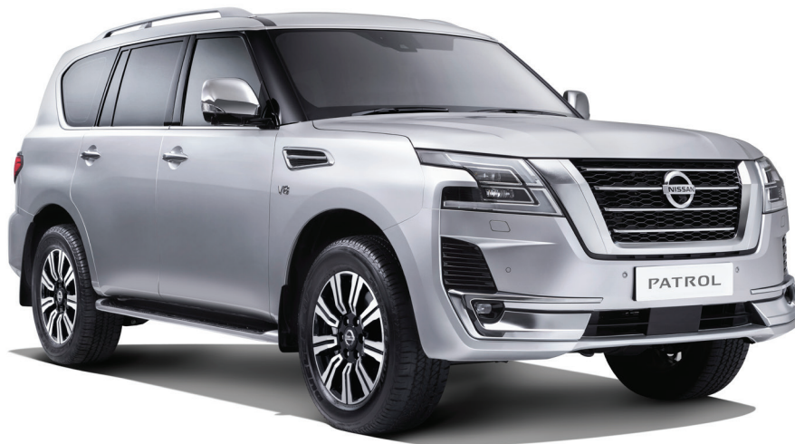
Brilliant Silver (K23)*