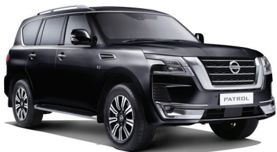
Black Obsidian (KH3)*