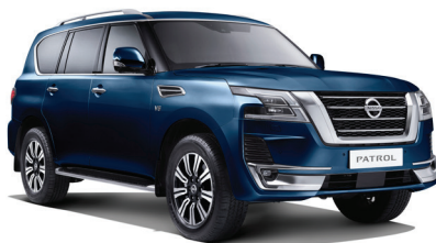
Hermosa Blue (BW5)*