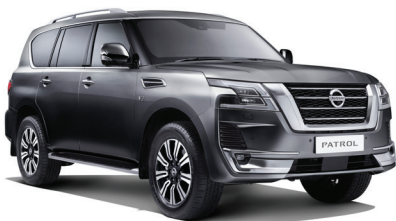
Gun Metallic (KAD)