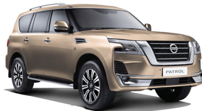
Champagne Quartz (HAG)*