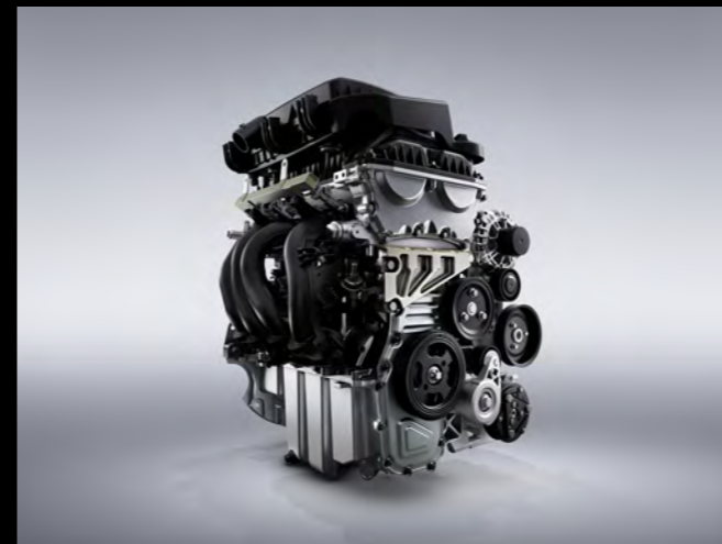
84kW 1.5L NSE Major