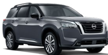
Gun Metallic with black roof#~