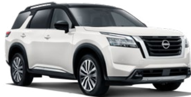
Ivory Pearl with black roof#~