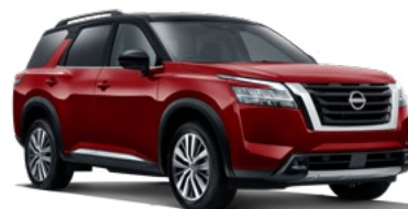
Scarlet Ember with black roof#~