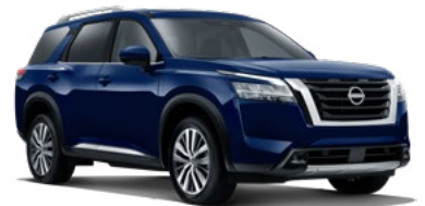
Deep Ocean Blue Pearl#