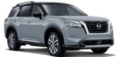
Boulder Grey with black roof#~