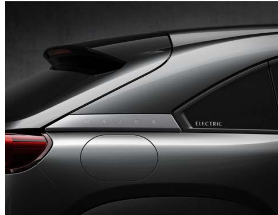
Machine Grey Metallic