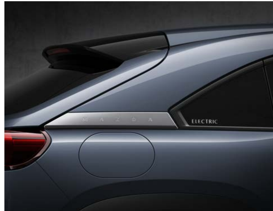
Polymetal Grey Metallic