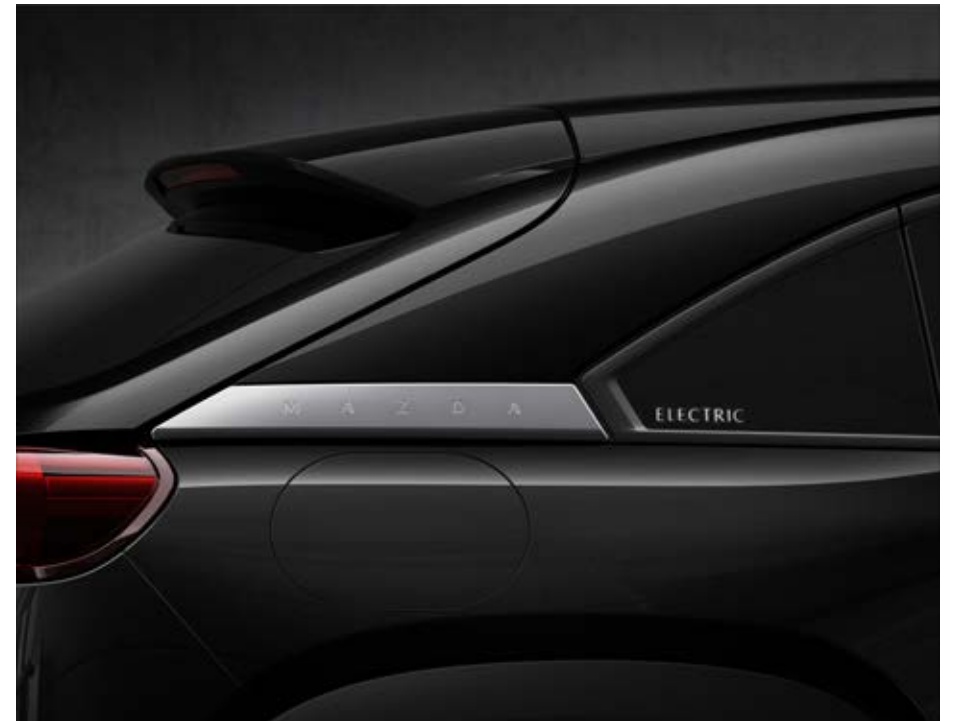
Jet Black Mica