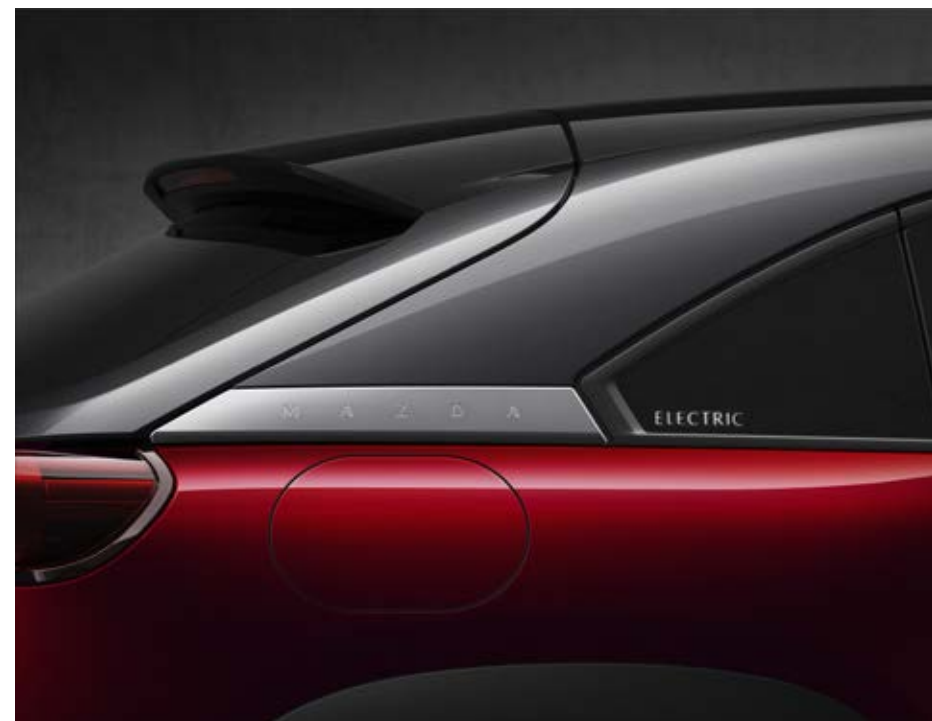
Soul Red Crystal Metallic with black roof top and grey sides.