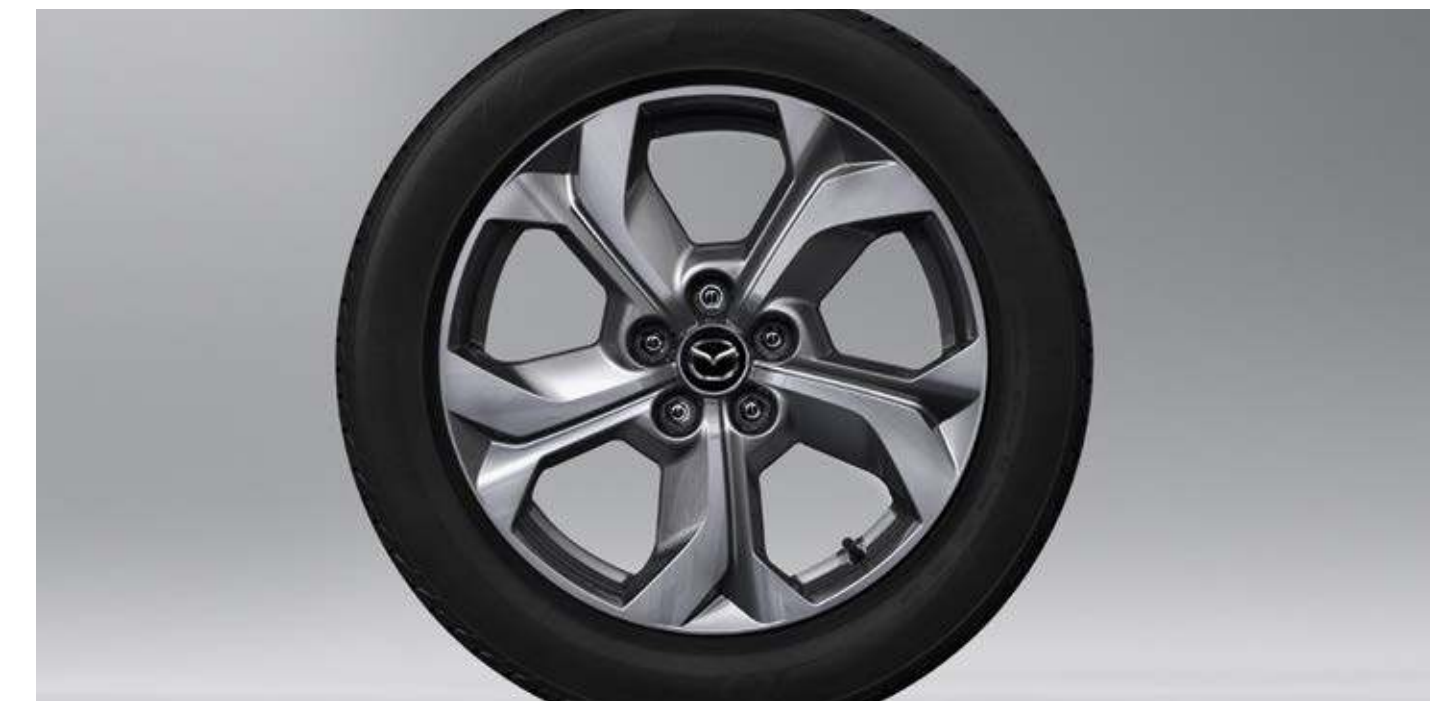
18-inch bright alloy