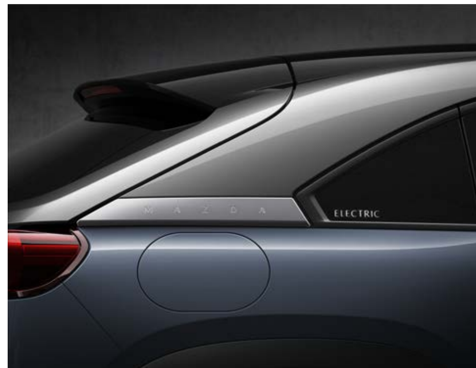
Polymetal Grey Metallic with black roof top and silver sides.