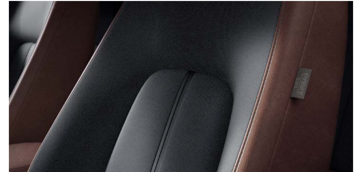
Vintage Brown Maztex with black cloth