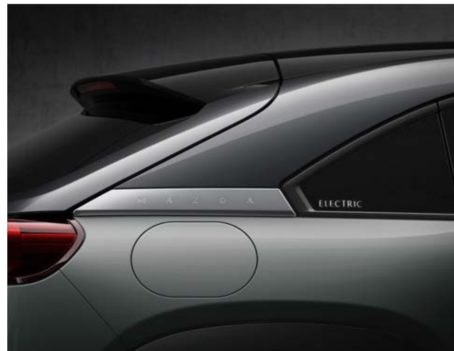
Ceramic Metallic with black roof top and grey sides.