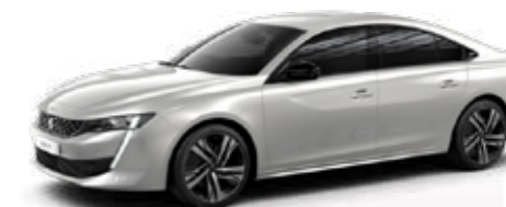
PEARLESCENT WHITE 1