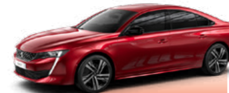
ELIXER RED 1