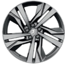
19" Augusta Two tone finish diamond cut alloy wheels (Standard on GT Fastback & Sportswagon)