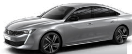
HURRICANE GREY 1