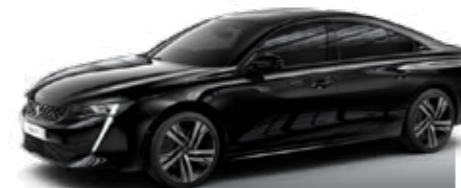
NERA BLACK 1