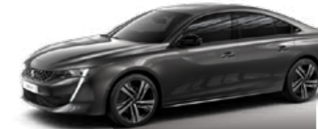
PLATINUM GREY 1