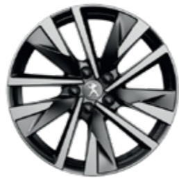
18" Sperone Two tone finish diamond cut alloy wheels (Standard on GT PHEV)