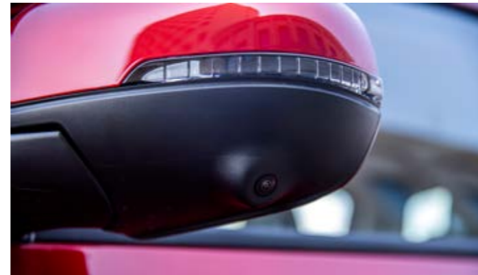
▲ Curbside camera