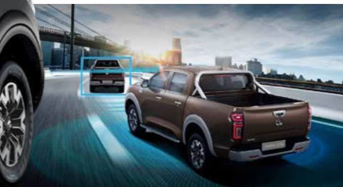
▲ 360 view camera, FCW+AEB, Lane Change Assist & Lane Departure Warning ^