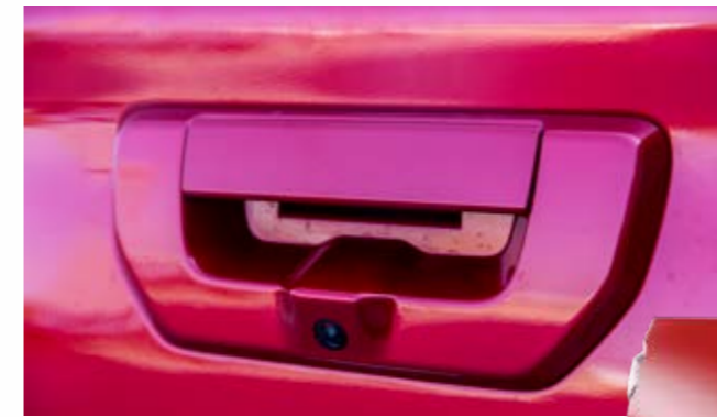
▲ Reversing camera