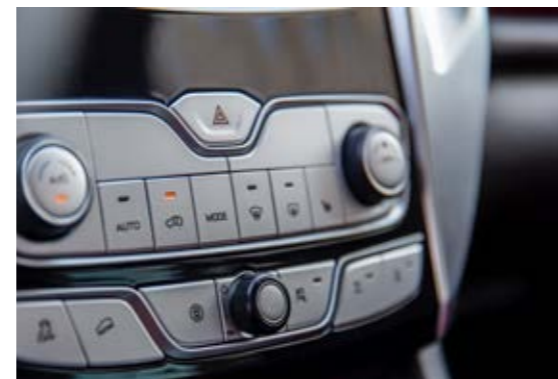
^ Overseas model shown. Specifications may vary.