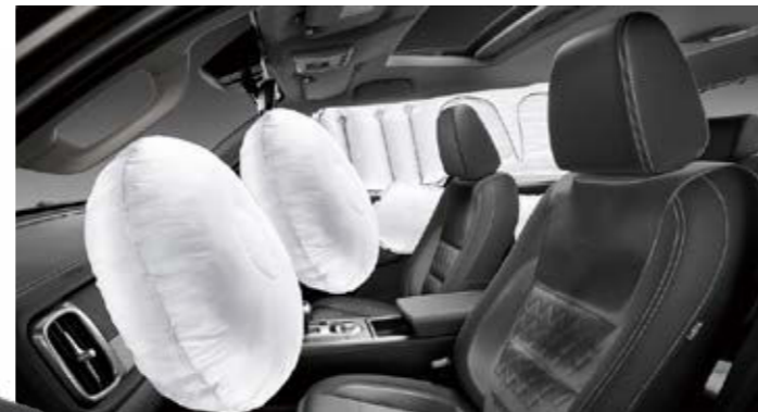
▲ Front, side, centre and curtain airbags ^