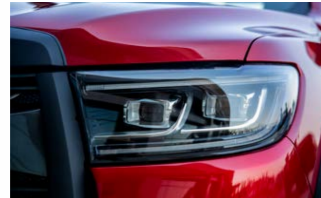
▲ LED headlights with daytime running lights