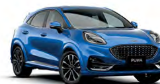
Desert Island Blue*^